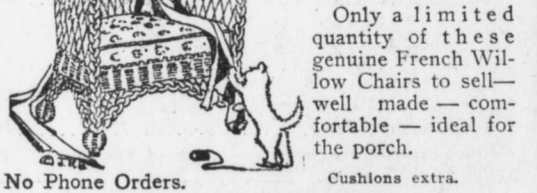
No Phone Orders. Cushions extra.

Bar Harbor Willow Chairs Special at $3.45 Only a limited quantity of these genuine French Willow Chairs to sell—made—comfortable—ideal for the porch.