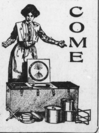
(Demonstration in Our Housefurnishing Basement)

This "Domestic Science" (that's the name of it) Fireless Cooker is the "last word" in fireless cookers—the latest and best of all productions. It is made in the largest fireless cooker factory in the world.