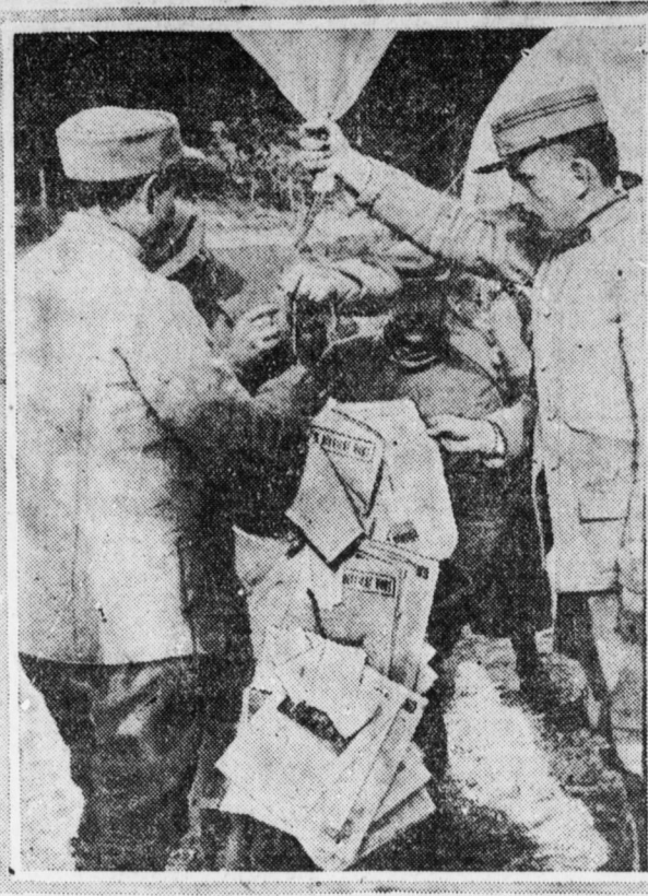
PRESIDENT'S MESSAGE. Hundreds of thousands of copies of President Wilson's message to Congress were scattered over the German lines in France. Many of these printed copies, translated into German, were distributed by aviators and many by small balloons that burst when over trenches and scattered the copies broadcast. This photograph shows one of these balloons being started on its journey of enlightenment.