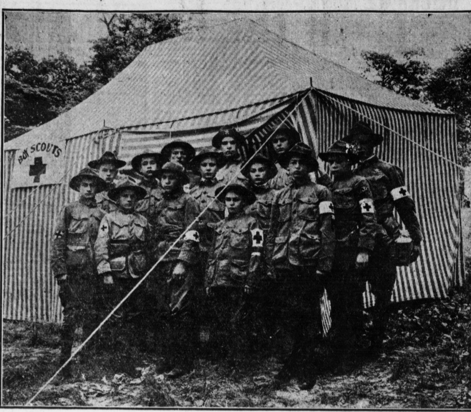
THIS SHOWS A GROUP OF BOY SCOUTS ENGAGED IN RED CROSS WORK.

scouting expedition. His scalp was lacerated and bled profusely. A member of the troop tore his shirt into bandages and tied the cut as he had been trained, to prevent loss of blood. Others made a litter from coats and carried him in reach of an ambulance already phoned for. The injured boy was treated at the hospital and the attending physician declared he had never seen a better white man.