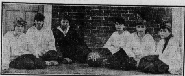
The girls' basketball team of Swatara township High school, closed a successful season this week. In all fifteen games were played, including contests with Hershey High school, Annville High, Camp Hill High, Lincoln Grammar, Steeple Grammar, Steelton Grammar, Hummelstown and Steelton girls.