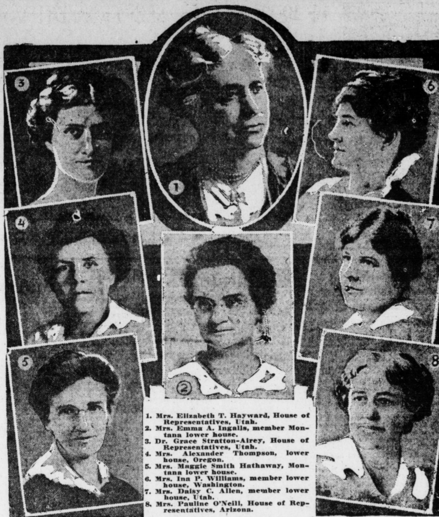
Eleven women are members of the Legislatures of western states, according to figures just obtained by the American Woman Suffrage Association. Nine are Democrats and two Republicans.