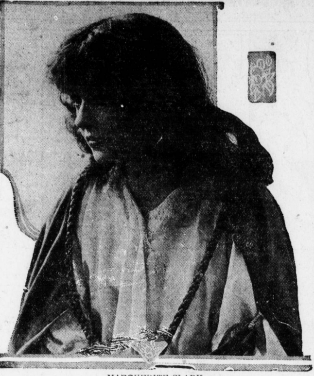
MARGUERITE CLARK Star who will be seen at the Regent to-day and Wednesday in her new screen success, "The Fortunes of Fifi."