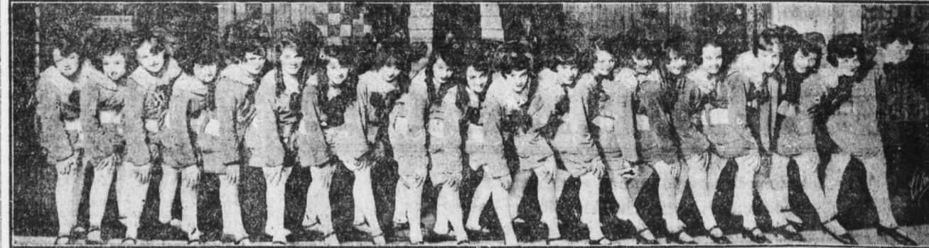
THE MIMIC WORLD OF 1917 - 25 PEOPLE THE BIGGEST AND BEST MUSICAL COMEDY ON THE VAUDEVILLE STAGE