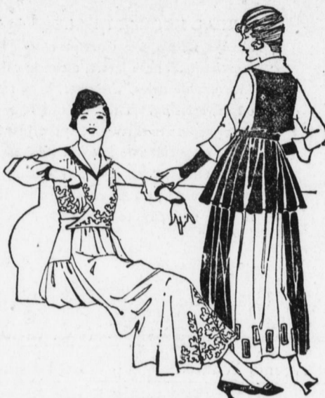
Georgette crepe and chiffon taffeta dresses; the waist is made with a large cape collar and deep revers of sand colored Georgette crepe finished with beaded trimming; deep tunic and girle trimmed with a fancy crocheted button. .... $39.50 Dives, Pomeroy & Stewart—Second Floor.