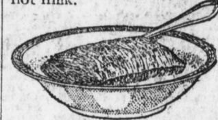
Made at Niagara Falls, N. Y.

Your Daily Bread ought to contain all the rich, body-building material in the whole wheat grain prepared in a digestible form. In Shredded Wheat Biscuit all this material is retained and made digestible by steam-cooking, shredding and baking. It is the best whole wheat bread because every shred is baked crisp and brown. Start the day right with a warm, breakfast of Shredded Wheat with hot milk.