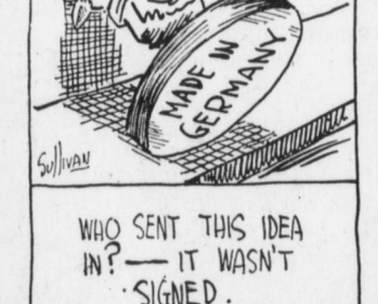
WHO SENT THIS IDEA IN?—IT WASN'T SIGNED.