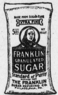
Sold in 2, 5, 10, 25 and 50 lb. cotton bags, refinery packed

Franklin Granulated is a cane sugar of highest sweetening power. It is absolutely clean and is never touched until you open the bag or carton.