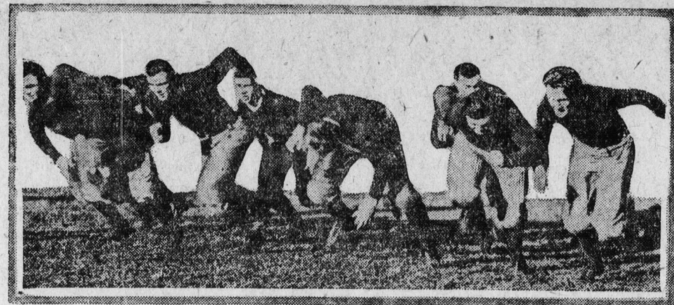
SPRING FOOTBALL PRACTICE The University of California football team training at Berkeley, Cal. This is the only college that trains its men for football in the spring.

features of the new rules adopted by the football rules committee for the 1917 season. The committee at its annual session, which closed here on Saturday, instructed the secretary to prepare corrections and additions to the code to cover the following changes: