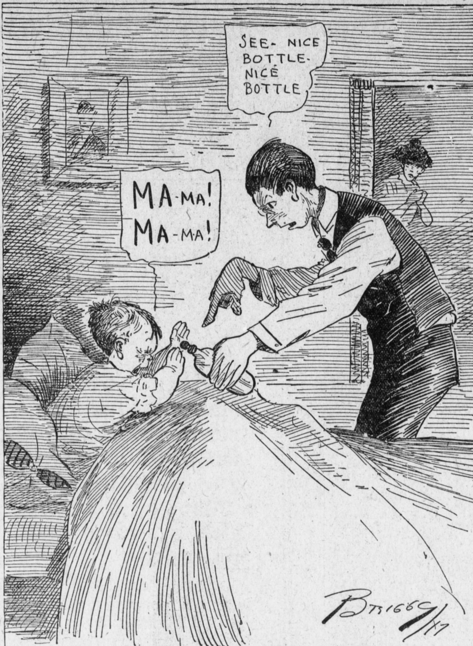
Copyrighted 1917 by The Tribune Assoc. (New York Tribune)