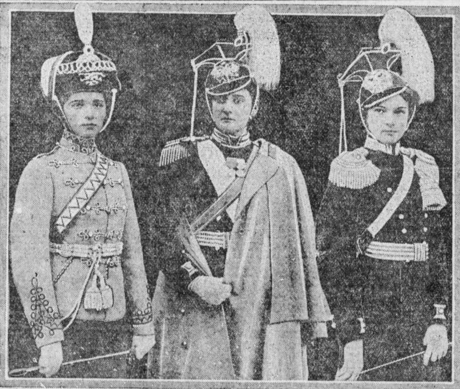
GRAND DUCHESS OLGA daughters, the Duchesses Olga and Tatiana. The photograph shows them in the uniforms of the regiments of the Czarina and her two grown daughters. Tatiana. The photograph shows them in their military uniforms.