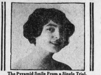
The Pyramid Smile From a Single Trial.

Send For Free Trial Treatment. No matter how long or how bad—go to your drugstore today and get a 50 cent box of Pyramid Pile Treatment.