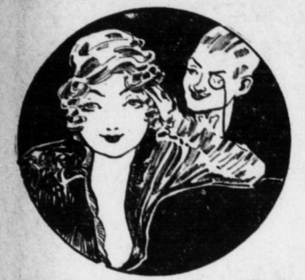
"Stuart's Calcium Wafers will give you an excellent skin color and remove all facial eruptions."

No need for anyone to go about any longer with a face covered with pimples, blotches, eruptions, blackheads and liver spots. These are all due to impurities in the blood. Cleanse the blood thoroughly and the blemishes will disappear.