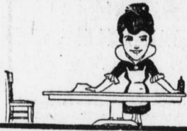
Miss RUBY GLOSS Shows the Easy Way to

To make this splendid cough syrup pour 2 1/2 ounces of Pinex (50 cents worth), into a pint bottle and fill the bottle with plain granulated sugar syrup and shake thoroughly. You then have a full pint—a family supply—of a much better cough syrup than you could buy ready-made for $2.50. Keeps perfectly and children love its pleasant taste. Pinex is a special and highly concentrated compound of genuine Norway pine extract combined with guaiaic and is known the world over for its promptness, ease and certainty in overcoming stubborn coughs and chest colds. To avoid disappointment, ask your druggist for "2 1/2 ounces of Pinex" with full directions, and don't accept anything else. Guaranteed to give absolute satisfaction or money promptly refunded. The Pinex Co., Ft. Wayne, Ind.