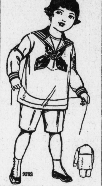
9289 (With Basting Line and Added Seam Allowance) Boy's Middy Suit, 2 1/2 and 6 years.

This suit is especially designed for the younger boys. Since it is modeled in the midly style it will be quite correct for little wearers for they are always happy when they emulate the sailor. It is a simple style and easily made, and consequently will make an appeal to the mother.