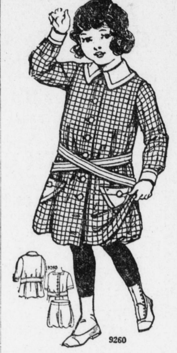
9260 (With Basting Line and Added Seam Allowance) Girl's Dress with Bloomers, 2 to 8 years.

This is a very fashionable little dress for school and for general wear. It is made of shepherd's check and it is trimmed with broadcloth in a pale green to be very charming in effect.