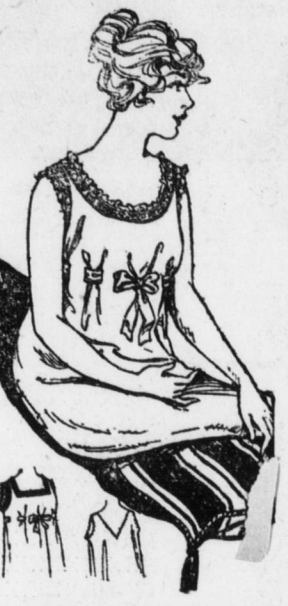
9233 (With Basting Line and Added Seam Allowance) Chemise, small 34 or 36, medium 38 or 40, large 42 or 44 bust.

There is no daintier under garment than the simple chemise. This one is made simply in two pieces with only the shoulder and under-arm seams to be sewed. The neck can be cut on a round or square outline.