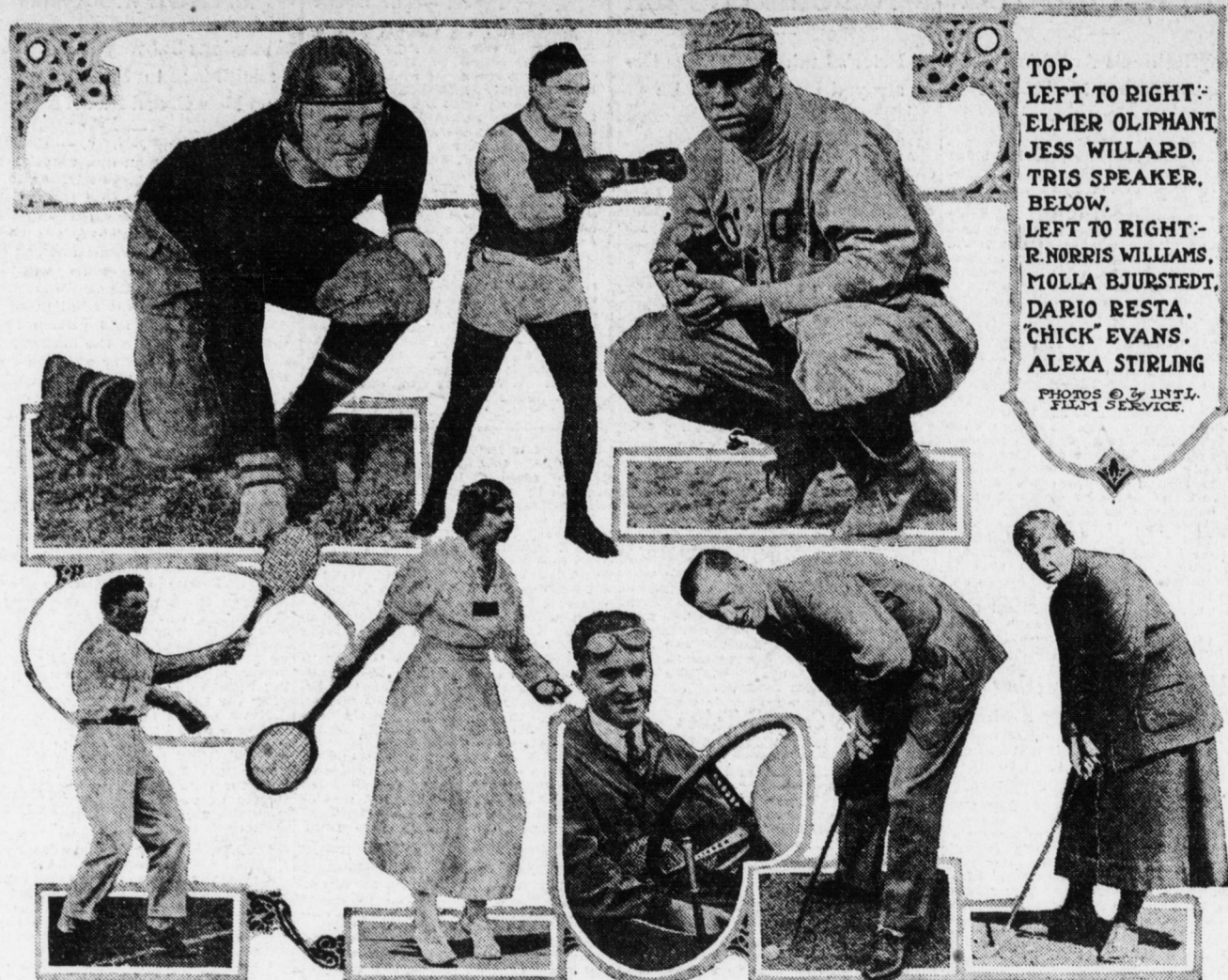
TOP. LEFT TO RIGHT: ELMER OLIPHANT, JESS WILLARD, TRIS SPEAKER. BELOW. LEFT TO RIGHT: R. NORRIS WILLIAMS, MOLLA BJURSTEDT, DARIO RESTA, CHICK EVANS, ALEXA STIRLING.

Who will be the champions of 1917? Only Dame Fortune could say. Here are the present holders of titles in the various important branches of professional and amateur sport, but will they be able to hold the laurels they have won?