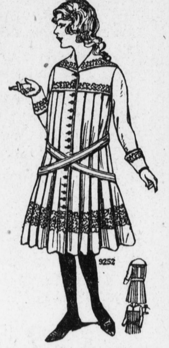
9252 (With Basting Line and Added Seam Allowance) Girl's Side Plaited Dress, 8 to 14 years.

There is no more fashionable trimming than soutache applied over a stamped design and it is exceedingly handsome on the serge illustrated and on all similar materials.