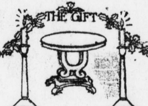
Parlor and Library Tables, in Oak and Mahogany—35 styles—at $7.50 to $95.

She'll always appreciate it because of its beauty and usefulness. It will be an easy matter to select the right one from our large assortment of Wicker and Mahogany Tea Wagons—heavy rubber tires—removable trays—some with auxiliary wheel. Wicker Tea Wagons—fumed and mahogany stained—crotone lined trays—$14 and $15.50. Golden Oak and Mahogany Tea Wagons—removable glass trays—$15 to $25.