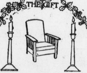
Royal Vest Chairs, in Oak and Mahogany—tapestry and leather covered—eight styles—at $13.50 to $35.

Special Rugs $3 at..... 27x54 Axminster Rugs—exceptional qualities—newest and most distinctive designs.