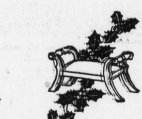
Foot Stools, in solid Mahogany—beautifully upholstered—six styles—at $5 to $16.

For the head of the house—a sensible, practical and substantial gift. In Oak and Mahogany—comfortable high back—wood seats and upholstered seats—also upholstered seats and back in leather or tapestry. Wood Seat Comfort Rockers, $4 to $15. Upholstered Seat and Back Rockers, $15 to $35.