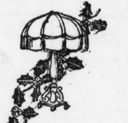
Floor and Table Lamps, in Oak, Mahogany and Gold—20 styles—at $3 to $35.00.

ASH TRAYS for table use, with removable tray—Oak and Mahogany—Match box and cigar holders attached—$1.50 to $2.75. SMOKER'S STAND AND TABLES—in Oak and Mahogany—removable trays—cigar and match-box holder attached—$5.50 to $6. SMOKER'S STANDS with humidifier—in Oak and Mahogany—$15 to $20.