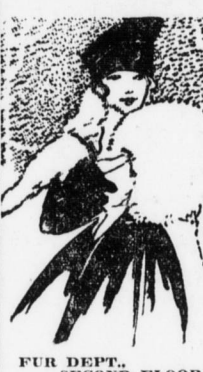
FUR DEPT. SECOND FLOOR.

Furs are the Gift Supreme. Valuable, intensely appreciated and Kaufman Values and Varieties are Superb. Hundreds of the choicest Pelts, in all this season's newest effects, ready for your selection; all priced extremely low for the great Xmas Economy Carnival.