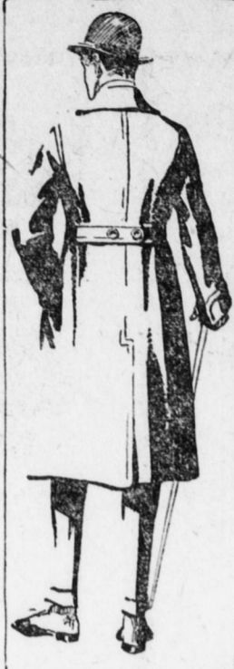
Other Overcoats in correct styles and fabrics, 30.00 to 50.00