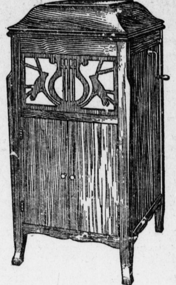
HARMONOLA No. 21 Style 21—$85 You would pay $100 or $150 for the corresponding type of other makes.

You must hear this wonderful Phonograph. They sell for $27.50 — the $40 size of other makes — $45, the $75 size of other makes — $85 for $150 size of other makes. YOU CAN PAY AS YOU GET PAID