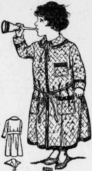
9220 (With Basting Line and Added Seam Allowance) Child's Bath Robe, 2 to 8 years.

Here is a little bath robe that will delight the young wearer and make him thoroughly cozy and comfortable no matter how cold the morning may be. It is a simple little robe and it is a smart little robe at the same time. It is easy to make so that mother can undertake it without hesitancy, and it is just as cozy as it can be. In the picture, it is made from a flannel with ribbon bandings but flannel means eiderdown and the regular bath robe flannels and also the lighter weights. Which will be better will depend entirely upon where the little owner is sleeping, how cold his room is likely to be and special conditions of the sort. The pockets are placed exactly as are those worn by the big folk, so that the little child will be made very happy by that possession. Either a cord or a belt can be used to confine the robe. In the smaller front view, it is shown made of eiderdown flannel in pale blue and is bound with wash silk. That combination is practical for the materials both are washable. In fact, all the materials that are suggested for bath robes of the kind can be cleaned with soap and water for such condition is absolutely essential for the children's garments. The collar can be buttoned up about the throat or rolled open.