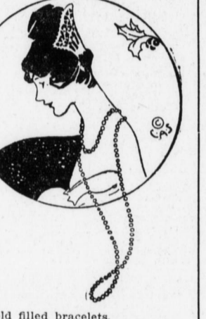
Gold filled bracelets, $1.25, $1.98 to $4.50