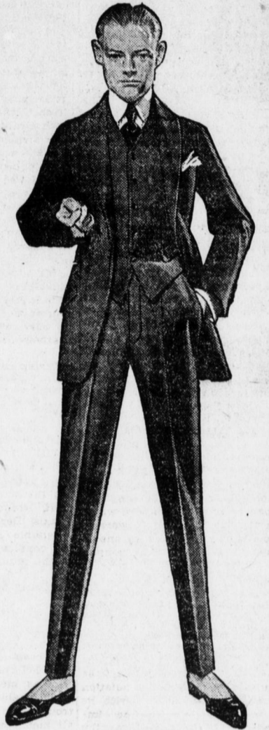
Copyright 1916 The House of Kuppenheimer