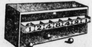
Here's a game that every one of the children will enjoy. Low priced and very durable.

Automobile A good, strong machine that is large in size and very moderately priced. $4.50. Others at $6.00, $7.50 and up.