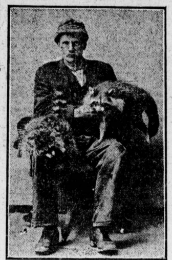
And Live Raccoons.

Loyalton Hunter Has Good Record For Season