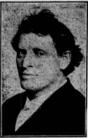
BISHOP WILLIAM A. QUAYLE, Of St. Louis.