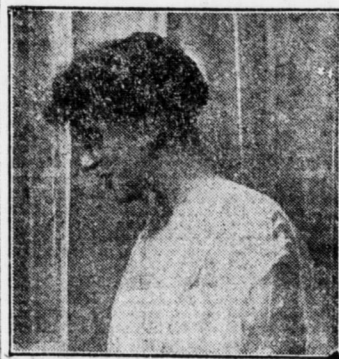
MARGARET WOODROW WILSON

Friday evening, November 17 at the Orpheum, Margaret Woodrow Wilson will be heard in recital with other artists.