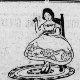
A Better Candy

Better because it's all homemade. That means purity, and the two go hand in hand in giving a tastiness unobtainable