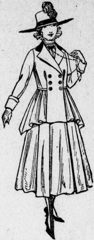
9196 (With Basting Line and Added Seam Allowance) Double Breasted Coat for Misses and Small Women, 16 and 18 years.