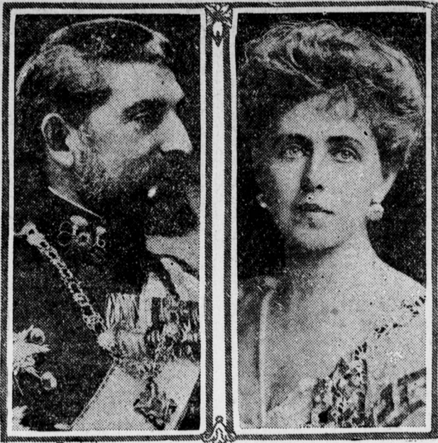
KING AND QUEEN OF RUMANIA

Another throne is tottering as a result of the war. If the Rumanians and Russians do not stop the advance of General von Mackensen and his Austro-German-Bulgarian-Turkish troops, another royal pair will be forced to flee their capital into exile on foreign soil adding one more to the number of deposed royal houses.