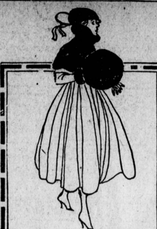
A showing of unusual and exceptional furs that surpasses all our previous efforts. Merely seeing them is a treat—especially the Silver Fox Sets.