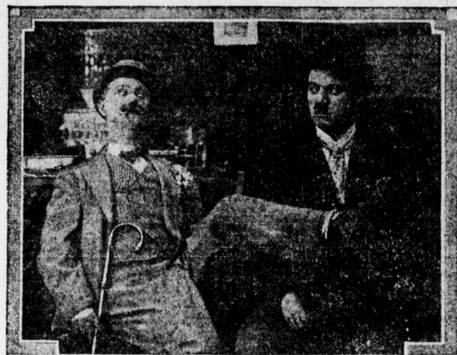
Scene from "Chaplin Revue of 1916," showing to-day at the Regent.