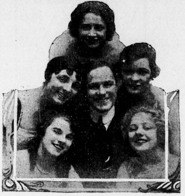
"Katinka," the musical play all Harrisburg was talking about one month ago, is again coming to the Orpheum. The date is the coming Friday, with a special matinee. An excellent cast, gorgeous production and special orchestra is promised.