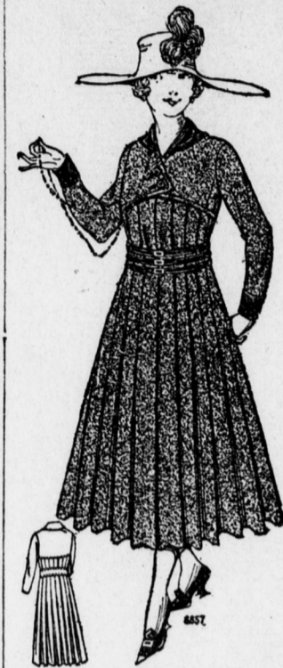
887 (With Basting Line and Added Seam Allowance) Dress with Plaits for Misses and Small Women, 16 and 18 years.

Bolero Effect on Bodice Gives a Smart Touch to This Natty Suit