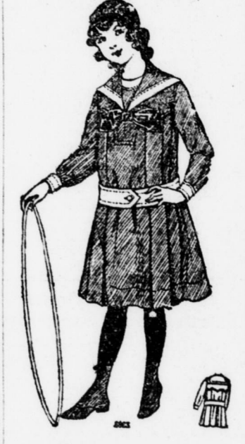
8823 (With Basting Line and Added Seam Allowance) Girl's Sailor Dress, 6 to 12 years.

This is a frock that suggests the middy idea. There is a plaited skirt and a sailor collar and a middy closing but below the yoke the dress is laid in box plaits. Here, the material is serge in chestnut brown and the trimming is champagne colored broadcloth. The contrast of fabrics is a good one as well as the contrast of colors but the frock could be copied in a blue serge trimmed with white or in galatea or in linen or in any simple material that is adapted to the girl's use. A great many mothers use the washable materials throughout the year. Blue linen with white would be very pretty or blue cotton gabardine with white. The separate shield is buttoned into place beneath the collar. The frock is a very simple one to make and at the same time essentially smart, a combination for which mothers are apt to be on the outlook. For the 10 year size will be needed, 4 1/2 yards of material 27 inches wide, 3 1/2 yards 36 or 2 3/4 yards 44, with 1/2 yard 36 inches wide for the belt and trimming. The pattern No. 8823 is cut in size from 6 to 12 years. It will be mailed to any address by the Fashion Department of this paper, on receipt of ten cents.