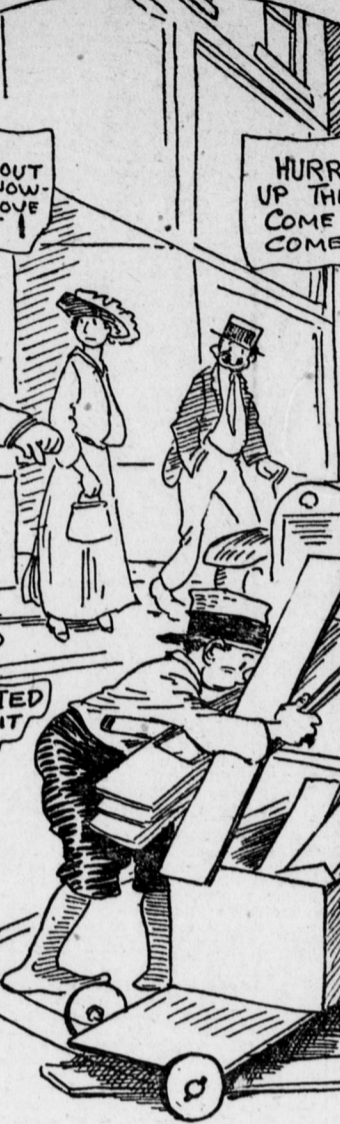
Democratic Carbondale shows a Republican gain.