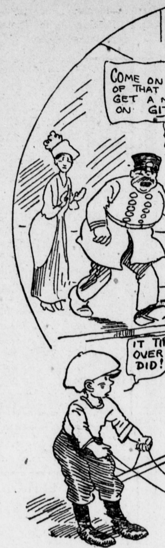
Democratic Carbondale shows a Republican gain.