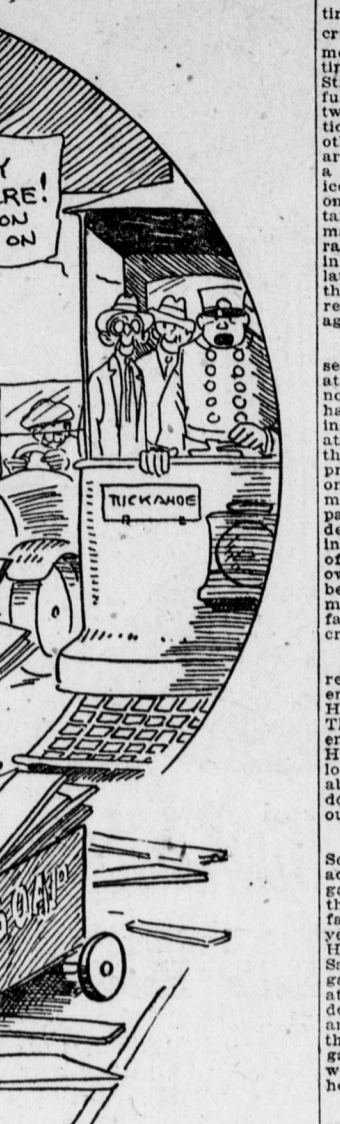
Democratic Carbondale shows a Republican gain.