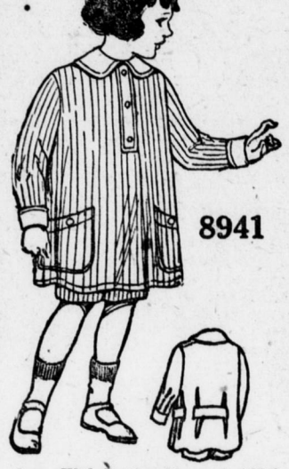
8941 (With Basting Line and Added Seam Allowance) Boy's Suit, 2, 4 and 6 years.

Efficiency Versus Neglect in Maintaining Health and Converting Them Into Fancy Stock