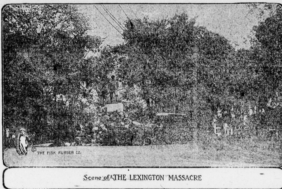
Scene of THE LEXINGTON MASSACRE

Lexington Green in Eastern Massachusetts, where British regulars first fired on American colonists, attracts hundreds of automobilists each day during the summer.