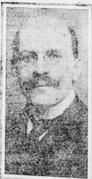
PROF. HUGO MUNSTERBERG.