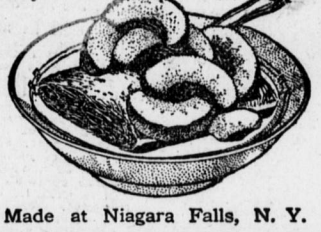
Made at Niagara Falls, N. Y.

"The Cold Storage Egg" is not always above suspicion. Popular imagination ascribes great food value to the egg—but it is not a muscle-builder. There is more real body-building nutriment in a Shredded Wheat Biscuit than in the same weight of eggs or beef-steak—and it costs much less. Delicious for any meal with sliced peaches or with fruits of any kind.