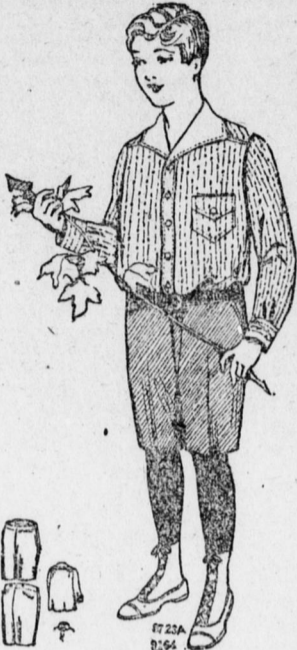
8723-A Boy's Shirt with High or Low Neck, 10 to 16 years. 9164 (With Basting Line and Added Seam Allowance) Boy's Straight Trousers, 4 to 14 years.