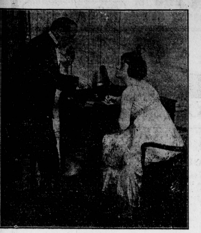
With the magic of a spectacular "Fair and Warmer" will come to the special matinee Wednesday.