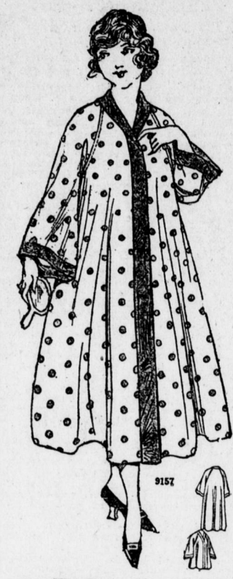
9157 (With Basting Line and Added Seam Allowance) Kimono for Misses and Small Women, 16 and 18 years