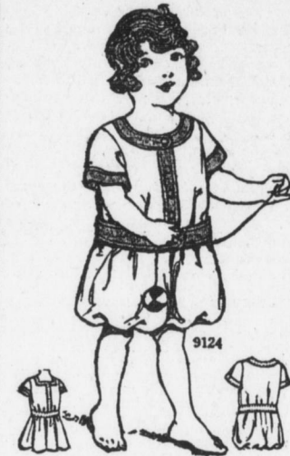
9124 (With Bathing Line and Added Seam Allowance) Child's Bathing Suit, 2, 4 and 6 years.

This is a suit that is warranted to make the small child happy. Without the skirt it can be used for either the boys or the girls. It is perfectly simple, it involves very little labor for the making and it is thoroughly comfortable.