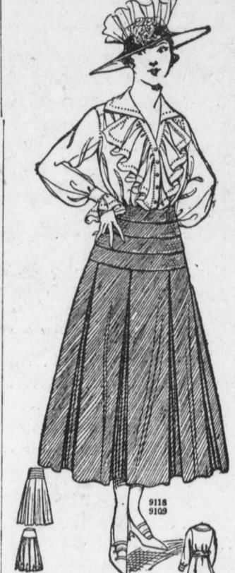
9118 (With Basting Line and Added Seam Allowance) Blouse with Frills, 34 to 42 bust. 9109 (With Basting Line and Added Seam Allowance) Box Plaited Skirt, 24 to 32 waist.

The frills on this blouse make its essential feature. They are exceedingly smart and the fashion is quite certain to be extended indefinitely. The skirt that accompanies it makes one of the prettiest and best models for wear with the odd waist or for the simple coat suit.